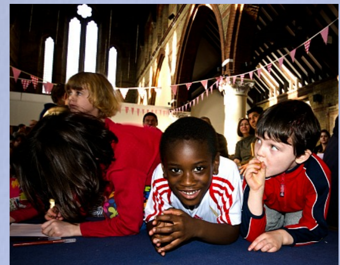
Children at St Simon's